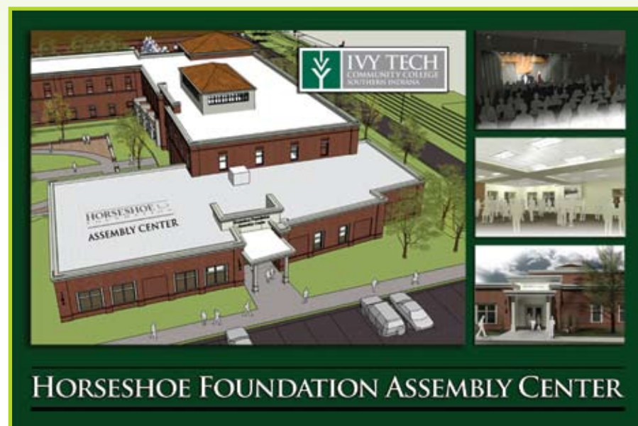
HORSESHOE FOUNDATION ASSEMBLY CENTER

The new building project will help the campus accommodate an ever-growing student body. In the spring of 2010, the campus passed 5,000 students for the first time. Enrollment stands at 5,371 students, a 16.6 percent increase from spring 2009, when 4,607 students were enrolled.